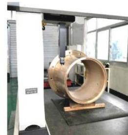
龙门三坐标 Three coordinates of gantry

If you need bronze parts of Cone Crusher, please feel free to contact us. Hope to do business with your company.