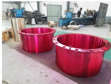
着色探伤 Dye detection